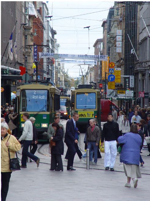
Trams on Aleksanterinkatu

In 1917 Helsinki became capital of the independent Republic of Finland. Throughout its 450-year history, Helsinki has existed in the crosscurrents of the East and West. The colourful layers of history can be seen everywhere; a walking tour of the city centre or of the magnificent Suomenlinna Maritime Fortress will open your eyes to a fascinating past.