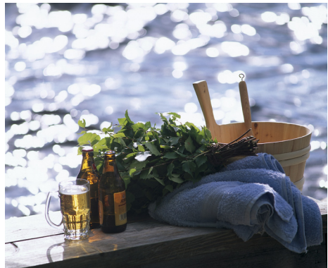
The sauna essentials